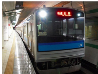
[Sengoku line, #10]

It takes approximately 25 minutes and costs 420 yen to get to Matsushima station. 15 minutes by a free shuttle bus to the Hotel Matsushima Taikanso (via Matsushima-Kaigan station).