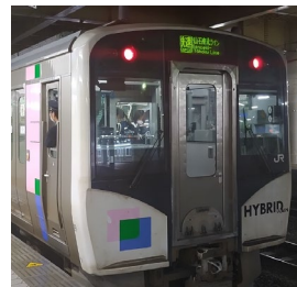
[Tohoku line, #1, #2]

Route chart of Sengoku (lower black) & Tohoku (upper black) lines