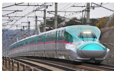
[Hayabusa or Yamabiko]